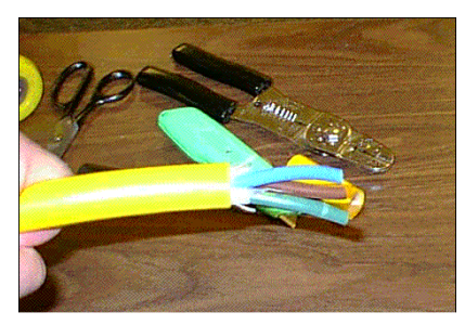
4 Strip cord and attach to device (see device's instructions).