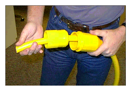
3 Push cord through the plug/connector housing.