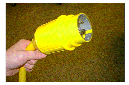
6 Be sure boot is on as far as it will go.

2655 Napa Valley Corporate Drive Napa, California 94558 (707) 226-8600 FAX: (707) 226-9670