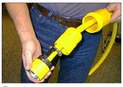
5 Lubricate mouth of boot and rear shoulder of device with soap solution and pull into place.